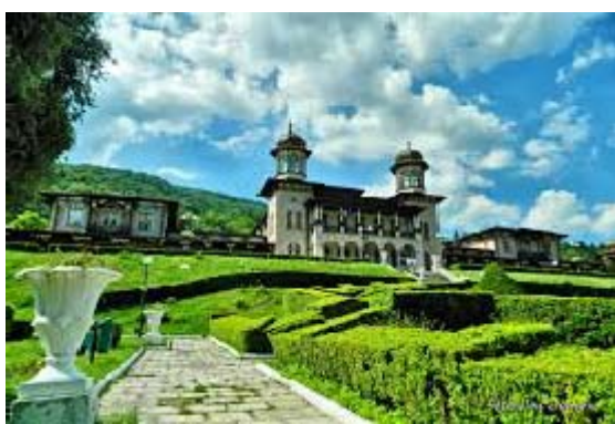
Geography - location, component, climate

The main avenue in town Slănic Moldova National Road 12B Tg Ocna - Slănic Moldova.