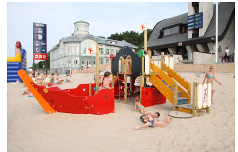
Playground on Jurmala Beach

The book has been based on many years' researches (1962. – 1992.) that were carried out by the researchers of resort scientific labs together with the Hidrometeorological centre, Latvia's cardiological institute, Medical institute of Riga, department of geology, specialists of resort science and Physiotherapy institute of Moscow. This book is a very good help for doctors, middle medical staff, students and other employees of resort centres, as well as interesting and educational material for everyone, who takes care of his health.