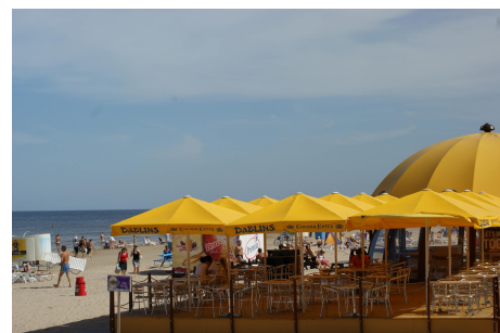
Beach of Jurmala