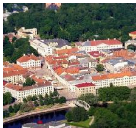
University of Tartu, Estonia