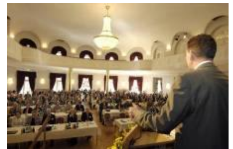
Opening of the German Spas Congress 2009 in Bad Tölz, Bavaria

A survey carried out by the DZT German Tourism Board in 2008 revealed that almost one in two Germans plan to do more for their health over the next three years. Given this domestic demand, relaxation and health tourism harbour enormous growth potential.