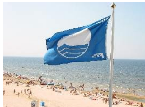
The blue flag on Jurmala Beach

Jurmala City has six lifeguard stations – in Bulduri, Majori, Dubulti, Mēluži, Kauguri (the most weighted) and in Jaunkēmeri – plus one mobile rescue tower. Each station covers the beach in 1.2 kilometres wide territory. Overall lifeguards are all lifeguards are supervising 8.4 kilometres of Jurmala beaches, which is not enough for 32.8 km long coastline of the city. Within the framework of the project there is a plan to purchase two more lifeguard towers and with that to increase the lifeguarding monitoring area up to 10.8 kilometres.